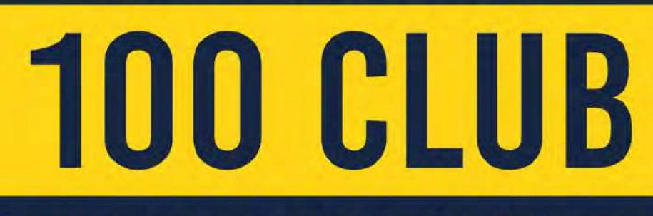
£10 A SQUARE | PRIZES: 1ST £100 / 2ND £50 / 3RD £25 | CHRISTMAS & END OF SEASON DRAW